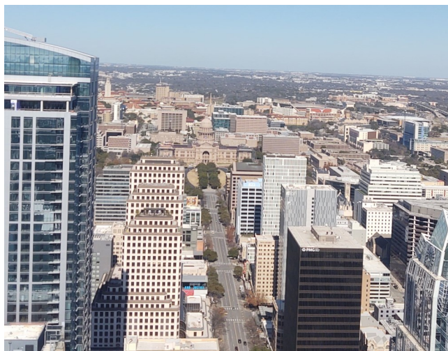
View of Congress Avenue and the State Capitol