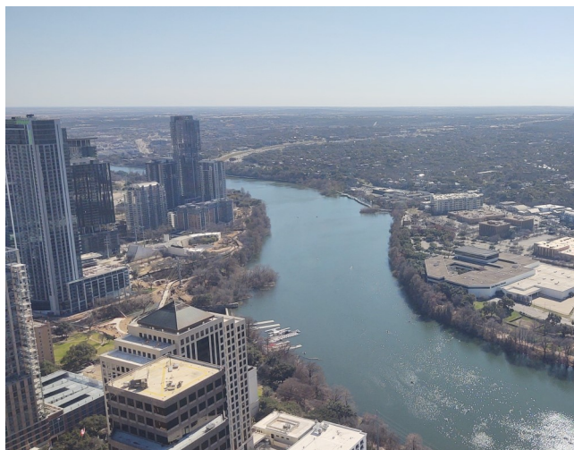
Lady Bird Lake